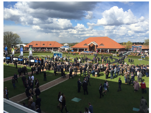
Racegoers and bookmakers enjoying the entertainment and seamless communications

Visit www.ggr.net for more information or contact us on sales@ggr.net .